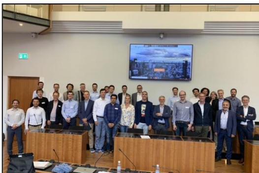
Digicities connects stakeholders in the digital value chain. Kickoff event in Lugano, 24 th May 2022.

The energy transition requires a paradigm shift in how we generate and use energy. Increasing interconnectivity and the rise of Industry 4.0 means that more data is available but there is still a lack of semantic interoperability between datasets. This restricts the development of scalable energy oriented applications. Digicities aims to overcome the barriers to accessibility and exchange of data for decision-making at a utility and municipality scale. A data architecture will be developed around structured, interconnected digital layers that will be used in the projection of energy demands. A framework for the processing, storage and use of data sources will be demonstrated in a living lab in each partner country. The project consortium has stakeholders from each stage of the value chain. This approach considers the impact of technical advancements and regulatory changes to develop a solution that will accelerate the energy transition to a net-zero energy system.